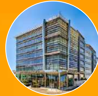
WORLD TRADE CENTER GIBRALTAR