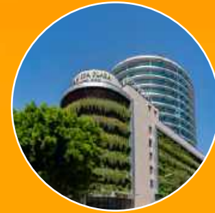
OCEAN SPA PLAZA