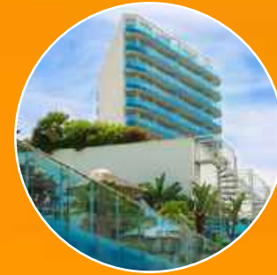
MAJESTIC OCEAN PLAZA