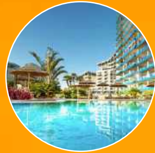
ROYAL OCEAN PLAZA