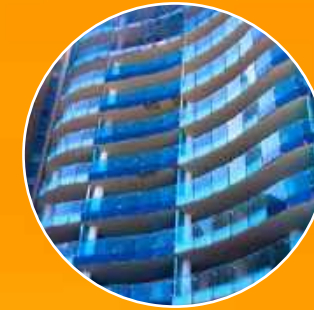
IMPERIAL OCEAN PLAZA