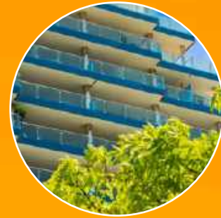
GRAND OCEAN PLAZA